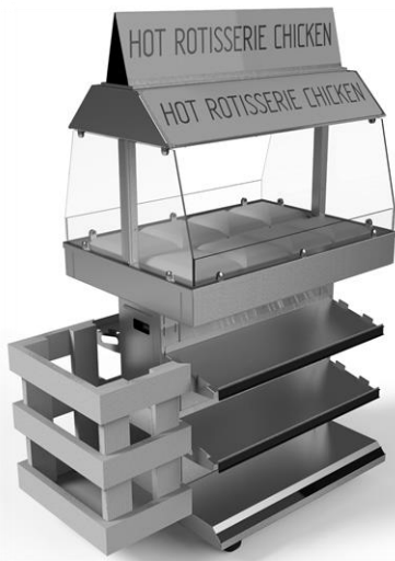
HH3625-NG Shown with Optional Bread Basket and Custom Sign Package