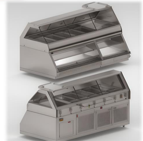
8' countertop hot food bar consisting of five-well full service section and grab & go self service section