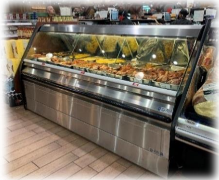
7-well 8' model shown with optional dry base