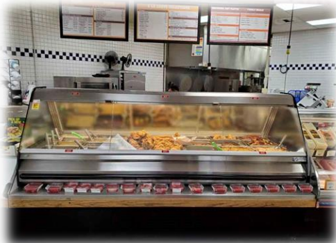
7-well 8' countertop model shown